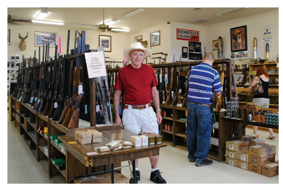
Prescott Valley Guns, has been in business since 1983. The current location has one of the largest gun inventories on view, typically 500 or more firearms.