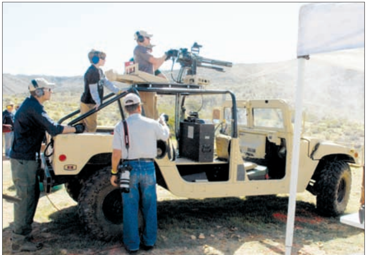
If you really want to multiply hit potential, select a Dillon Aero M134D Gatling gun firing at 3,000 shots per minute. This makes it easier, but still not a simple shot.

Several companies now supply anti-aircraft “spider ring” sights of varying designs. Other shooters are adapting the very latest in technology such as C-More and EO Tech sights with heads-up displays and holographic imaging. Original, high cyclic rate .30 caliber AN-M2 aircraft Brownings can be observed in action, even in twin mounts. Twenty-six hundred rpm from such a setup is striking, only outdone by the mini-guns that may also be in action.