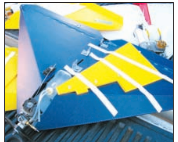
Fourth generation airplanes made from corrugated plastic are ready for assembly at the Big Sandy Shoot site. It's easy to bring a load of these and assemble onsite.

Hits through the wing are nonlethal. Kevin states, "The most common fatal hit is through the gas tank since it is under pressure from the engine's [Cont. to page 48]"