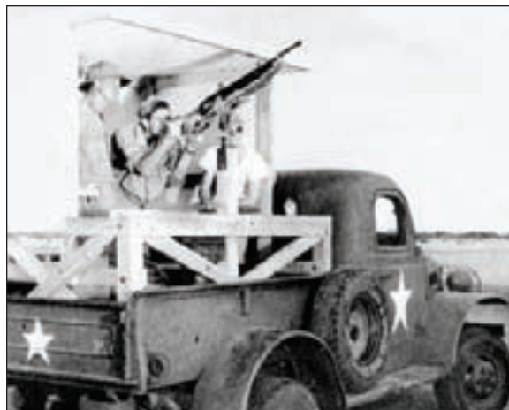
Once they’d mastered shotgunning from a solid surface, firing from fixed mounts on moving vehicles added new challenges for rookie aerial gunners during WWII.

Clockwise rotating bullets passing through the slipstream on the right will drop several feet at 1,000 yards relative to the drop on the left. Towards the end of the war, computing gun sights helped perform these estimations, but at the beginning, students had to be familiar with as many as 10 different sights in use and do it the traditional way—in their heads.