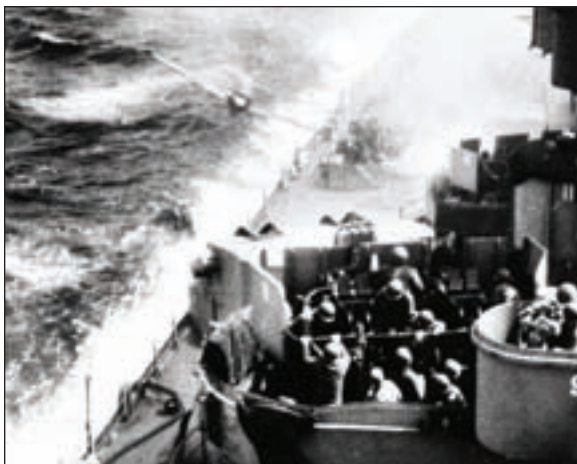
The USS Missouri about to be hit by a Japanese A6M “Zero” kamikaze, Okinawa, April 1945. A 40mm gun crew is in action in the lower foreground.