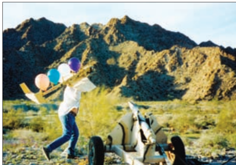
When using the Generation X airplane with balloon release mechanism, the object was to shoot the balloons as they were released individually and not the plane itself.

(RC) airplanes and guns, as briefly mentioned earlier and described in detail later. It is tremendously challenging and fun. But real aerial gunnery was anything but; it was terrifying and often deadly.