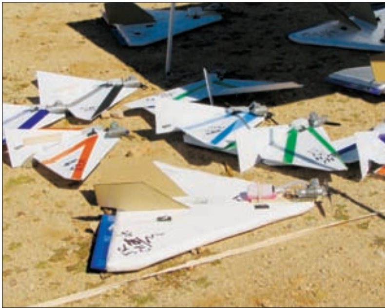
Replacing balsa wood with Styrofoam blocks cut cost even more. These planes are almost invulnerable to bullets passing through the wings; you need to hit a vital part.

[Cont. from page 44] trigger time is the key. Shooting an airsoft replica machine gun can be fun, but shooting the real deal is far more exciting. Reading about the challenges of aerial gunnery is fascinating, but actually doing it is another matter entirely.