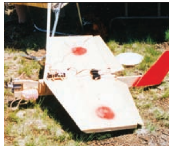
Shooters initially fired at commercial radio controlled planes, but these were expensive and hard to repair. They were replaced by simple balsa wood target planes.