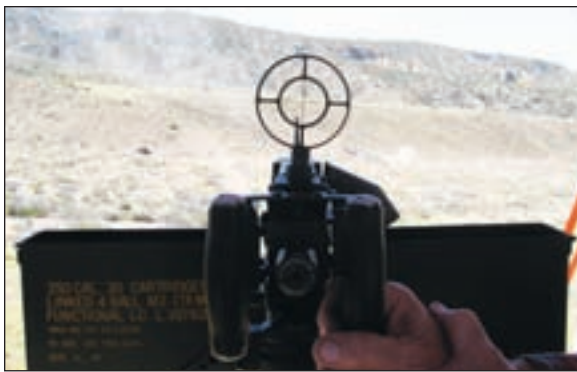
This AN-M2 aircraft Browning was manufactured by Savage and has original sights, spade grips and is mounted on Generation II AA adaptor system made by Beltfed Shooters.