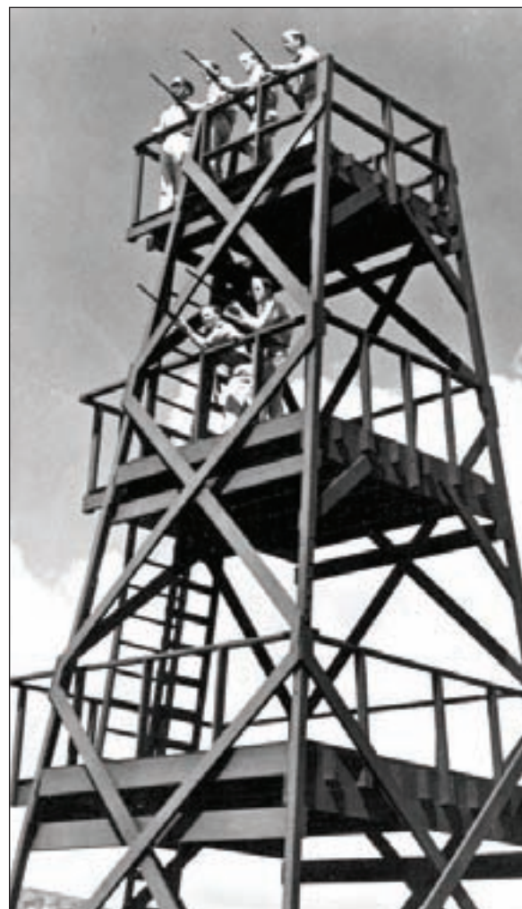
Before sporting clays was invented, trainees practiced with shotguns from varying heights to simulate high and low angles of enemy airplane attacks. (Kelsey McMillan)

Tracers, linked 1 in 10, also were used at the beginning of the war to assist in nighttime training to correct aim. But the subtle differences in aerodynamics between these and the other rounds were enough to cause a difference in trajectory as the tracer content burned. Their use for training by the U.S. Army Air Force was discontinued after the first year.