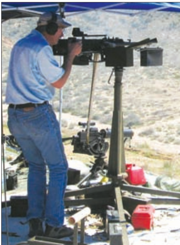
These twin AN-M2 aircraft Brownings are mounted on a rare twin gun adapter manufactured by Bell Aircraft. Note EO Tech sight and custom mount with counterbalance.

[Cont. from page 48] the lead for a .308 is roughly 35 feet. Considering that the plane may be moving at 100 mph and the vital parts are only a few inches across, one fully appreciates how difficult it can be. But some have grown quite proficient through a combination of low- and high-tech methods.