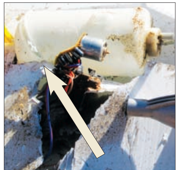
The most vulnerable part is the fuel tank, but a hit to the servos, receiver or the engine can put a plane out of action. These are small targets on a fast-moving plane.