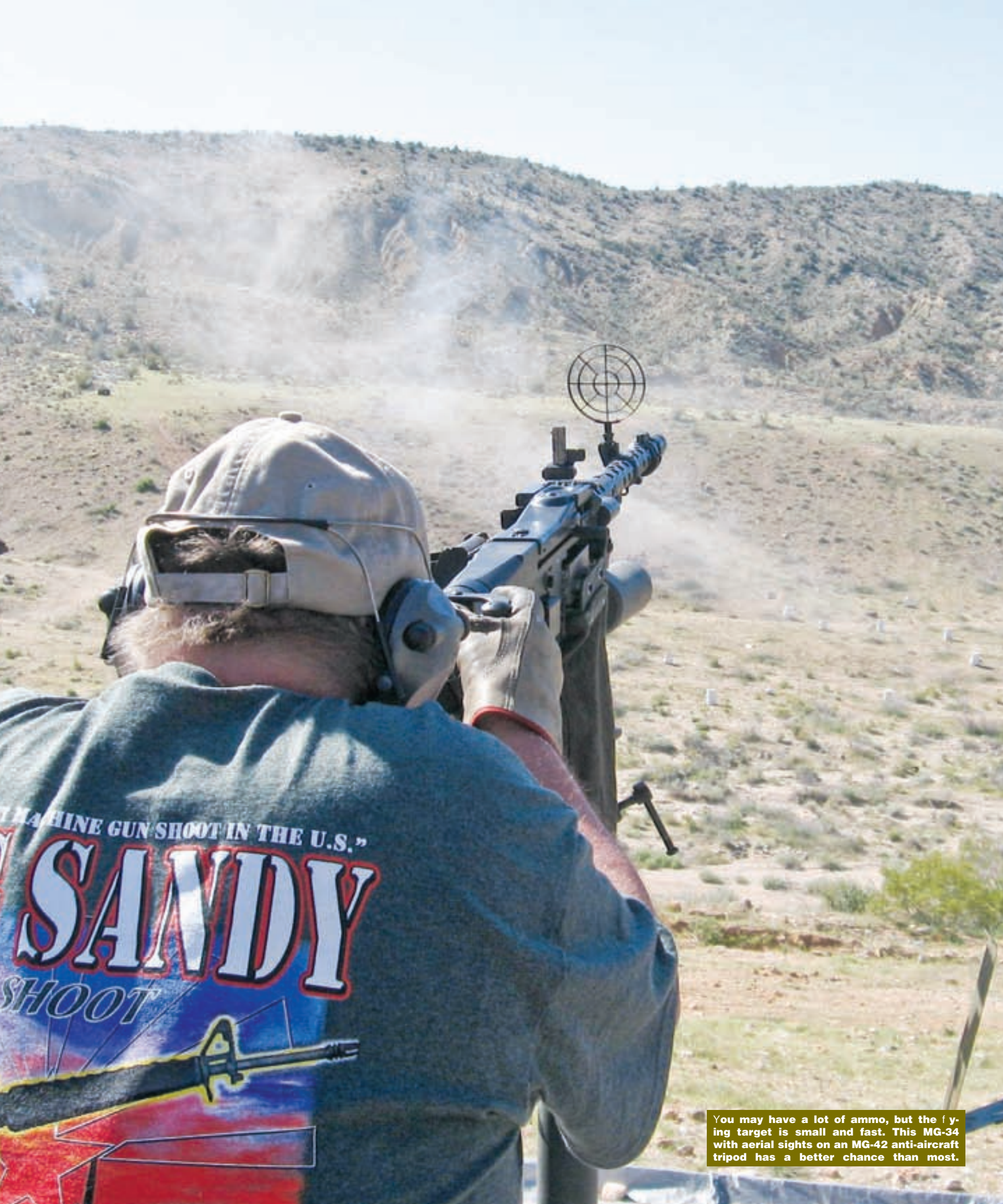
You may have a lot of ammo, but the flying target is small and fast. This MG-34 with aerial sights on an MG-42 anti-aircraft tripod has a better chance than most.